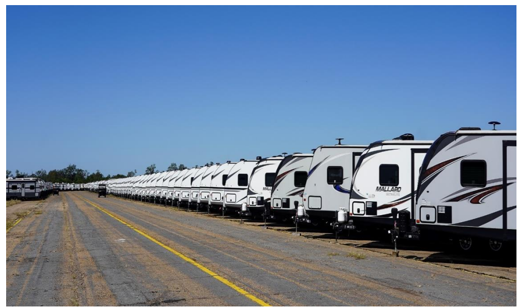
The staging area for FEMA's Temporary Housing Units located in Alexandria, Louisiana.

• Survivors choosing to return to damaged homes need to be sure they're safe. Because many areas may not have reliable power, those returning should have adequate food, water, medications, bug repellent, batteries and cellphone chargers. Walk carefully around the outside of your home and property and check for loose power lines, gas leaks and structural damage. If unsure, ask a qualified building inspector or structural engineer before entering. Enter your home carefully and check for loose boards and slippery floors. If your home looks like it may collapse, leave immediately. For more information on what to look for when reentering your home, go to <a href="ready.gov/returning-home">ready.gov/returning-home</a>