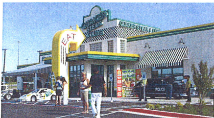
Photo Caption: Quaker Steak & Lube® features compelling décor, including race cars suspended from the ceilings, motorcycles, Corvettes and gas station memorabilia. (Location: Waco, Tx.)

Known for its Best Wings USA and more than 25 sauces, Quaker Steak & Lube® combines a casual atmosphere with craveable food. Favorites include the QS&L Boneless Wing Salad, Mustang Chicken Sandwich and the legendary LubeBurger. Check out the award-winning menu: www.thelube.com/category/menu .